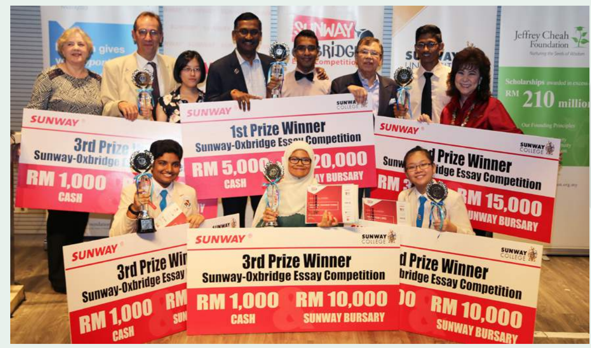
Dato' P. Kamalanathan, Deputy Minister of Education I with the Top 3 prize winners of the Sunway-Oxbridge Essay Competition 2016 Category A and Category B.

Twenty-six students from around the country emerged winners at the 3<sup>rd</sup> Sunway-Oxbridge Essay Competition